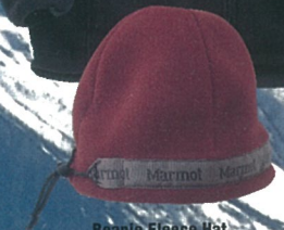
Beanie Fleece Hat