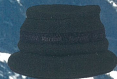
Townie Fleece Hat